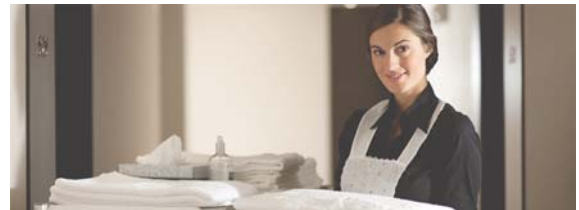
+ 150 EMPLOYEES